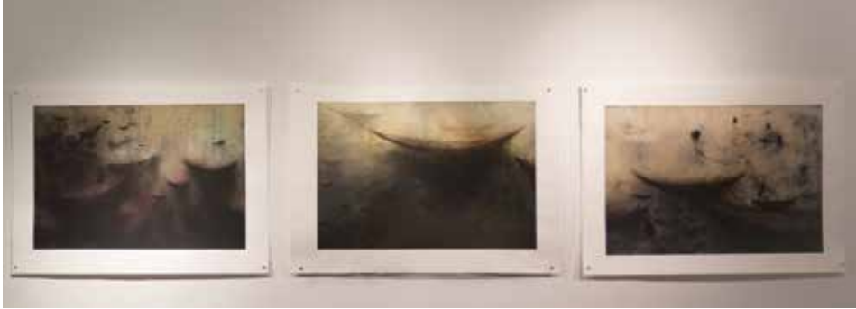
top: Migratory, Dropping lines, Intersect/don't touch (Kelsey Stephenson)