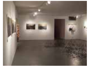
top: Surf and Turf (Jes McCoy)