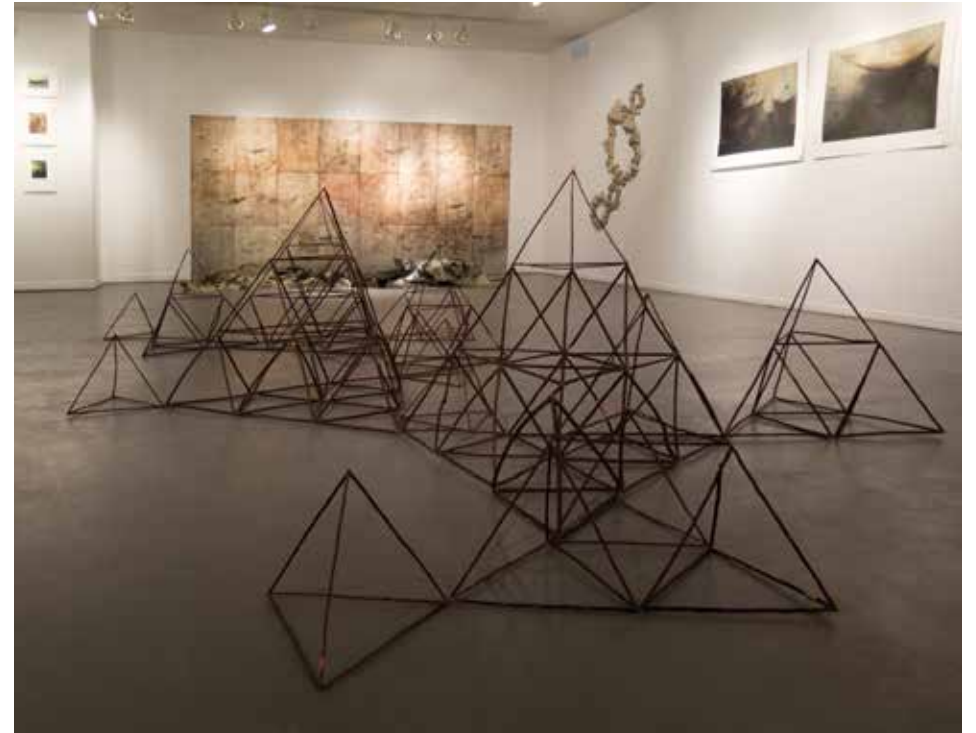
previous page top: Skin to Skin, Into the void (Kelsey Stephenson)