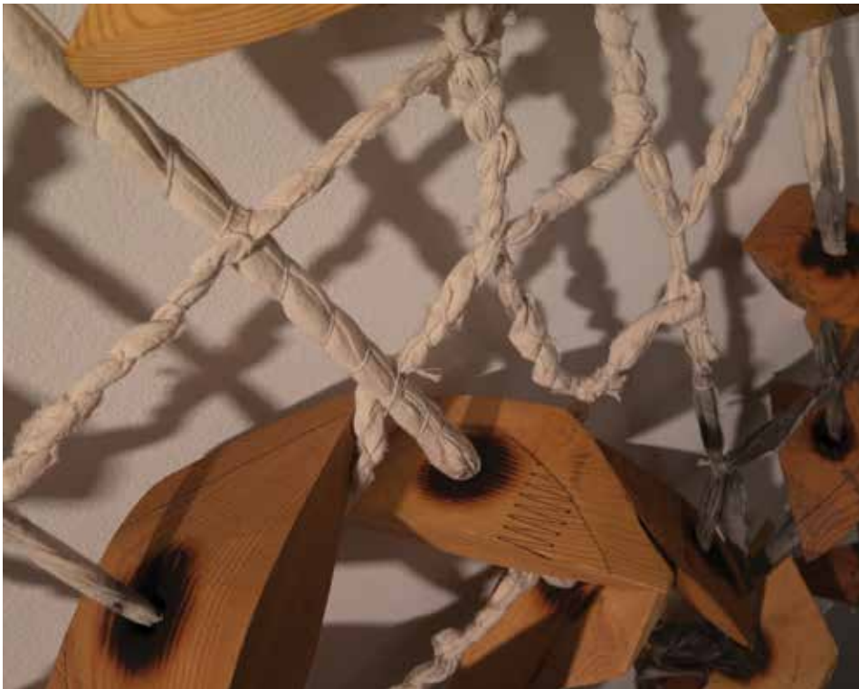
bottom: Catch of the Night (Jes McCoy)